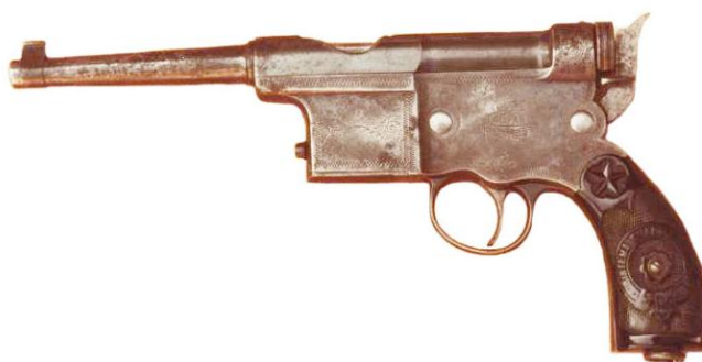
“Charola y Anitua” pistol, second type. Barrel inscribed: PISTOLA AUTOMATICA PATENTE CHAROLA Y ANITUA - EIBAR and bearing the first type’s trademark.

The second type pistols, about 900 in number (SN 951-1800), were produced by Ignacio Charola and they had a 95mm long barrel inscribed: I. CHAROLA, EIBAR, CAL 5 m/m and continued to bear the registered trademark Ch. y A. ; The rear sight is simplified and the tip of the barrel is reinforced with a muzzle band bearing a beaded blade front sight.