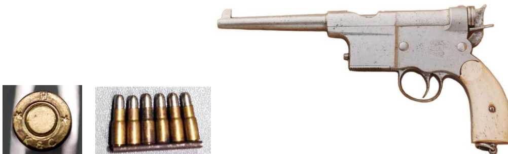
“Charola y Anitua” pistol, first type; Grips are not original

The second type pistols, about 900 in number (SN 951-1800), were produced by Ignacio Charola and they had a 95mm long barrel inscribed: I. CHAROLA, EIBAR, CAL 5 m/m and continued to bear the registered trademark Ch. y A. ; The rear sight is simplified and the tip of the barrel is reinforced with a muzzle band bearing a beaded blade front sight.