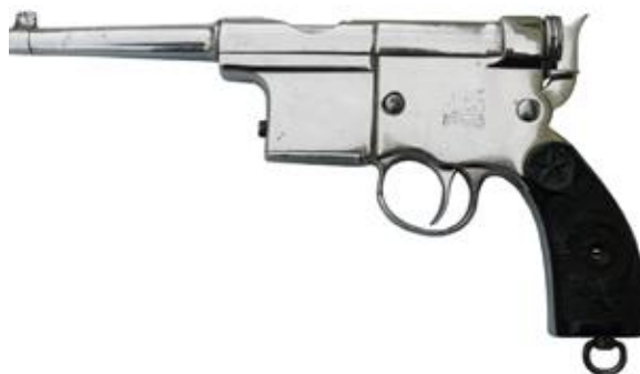
“Charola y Anitua” pistol, second type; Barrel inscribed: I. CHAROLA-EIBAR CAL.5 m/m, bearing the winged bullet emblem and the initials “Ch y A”

In the third type pistols, of which about 800 units were made, (SN 1801-2600) the barrel is only 85mm long and bears the legend THE BEST SHOOTING PISTOL ; Their hammer spur is also shorter; The fourth type, about 400 units, (SN 2601-3000) complete the 3000 that Fox estimates were produced; They bear only Liege proofs, indicating that they were made or assembled in Belgium for Ignacio Charola and have a bolt catch in addition to and next to the safety lever.