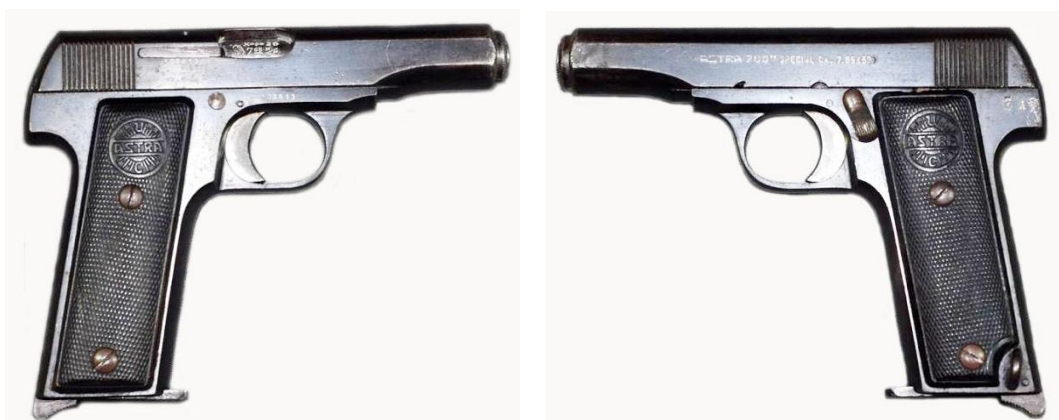
Twelve shot 7.65 mm caliber ASTRA 700 SPECIAL pistol; Marked "ASTRA 700 SPECIAL" Cal 7,65 (32), logo "ASTRA U C" (Unceta y C a ).