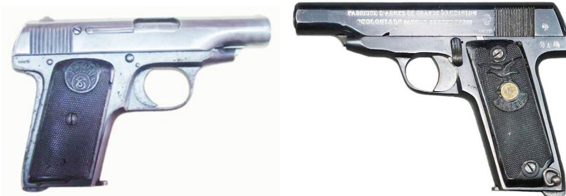
Eibar-type pistols. Left: The 9 mm. caliber 1921 MODEL VICTORIA marketed by E. Shilling. Right: The 7,65 mm COLONIAL marketed by “Etxezarraga, Ebaitua y C a ”

The arms industry in this period also marketed several models that only superficially resembled foreign designs such as the vague resemblance of the SUPER DESTROYER to a Walther PP or of Eduardo Shilling 1921 MODEL VICTORIA or of “Etxezarraga, Abaitua y C a ”s COLONIAL, and of “Alkartasuna S.A”s ALKAR to the 1910 Browning; In reality they are Eibar-type pistols mechanically based on the 1903 and 1906 Brownings; Gaspar Arizaga’s MONDIAL although superficially recalling a Savage, also has Browning innards.