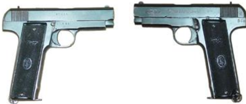
Twenty-two shot 7.65 mm caliber PLUS ULTRA pistol; 90 mm barrel; Marked PLUS ULTRA, Cal. 7.65; Logos "PLUS ULTRA" and "GC" (Gabilondo y C a )