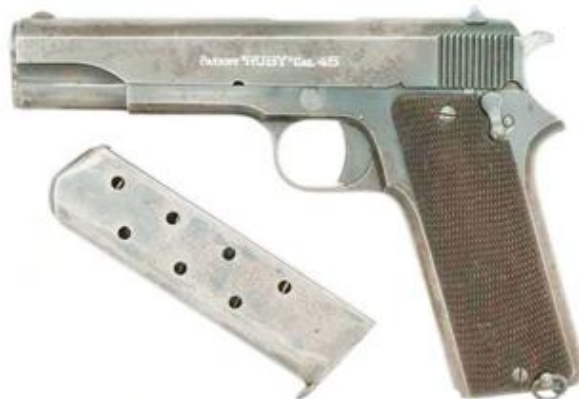
Colt 1911 based, 45 caliber pistol, made by "Gabilondo y Comp a " under the PATENT RUBY CAL. 45 trademark; In their Catalogue # 25 it was also offered in 9 mm caliber. (Photo Leonardo M. Antaris).