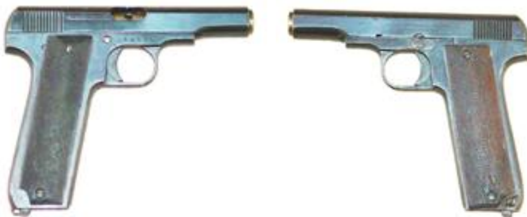
Twelve shot 7.65 mm caliber DANTON pistol; 100 mm barrel; Marked AUTOMATIC PISTOL WAR MODEL CAL 7,65 (32) / "DANTON" PATENT 70724-TESTED, logo "GC" (Gabilondo y C a ).

Probably because of the RUBY pistol's popularity during the Great War due to its 9 shot capacity, several models with even larger magazine capacity were introduced during the 1920s; "Gabilondo y C a " produced its DANTON with a 12 round capacity; "Astra y Unceta" its Eibar-type "ASTRA 100 SPECIAL" also with a 12 round magazine and, "Beistegui Hermanos" with its ROYAL, all three of them with elongated grips; "Gabilondo y C a " established a record with its Eibar-type RUBY EXTRA and PLUS ULTRA, registered in 1928, with a 22 shot magazine; It is said that the PLUS ULTRA, which was also marketed by "El Trust Eibarres S.L." as the "TRUST", was adopted by the Imperial Japanese Air Force.