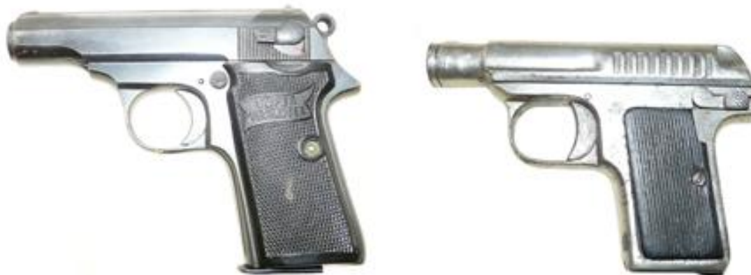
Left: The Browning 1910 based, 9 mm caliber, SUPER DESTROYER pistol, marketed by Isidro Gaztañaga. Right: 6,35 mm caliber, MONDIAL pistol (1920) marketed by Gaspar Arizaga