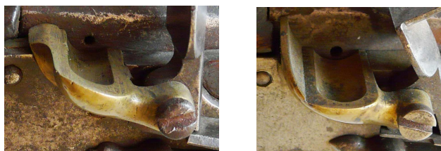
Flash pans of the 1812 “improved” lock model used in pistols and incorporated into the French 1816 lock in the “tercerola”; Both locks with similar dimensions, around 135 mm long; The flash pan of the second one is of the type used with the Model 1828 lock, with a different cock.

We may ask ourselves if, in the same manner as with the model of pistol, this model of “tercerola” was originally conceived for the Brigade of “Carabineros Reales” with characteristics which are unknown to me at this time; In any case, in contrast to the pistol model, the model of “tercerola” which was supplied by Ibarzabal to the Royal Guard’s Regiment of “Cazadores” lacks any original details; It’s lock is the French one of 1816 and therefore different to the model, “improved” in 1812, used in the pistol models used by the Brigade of “Carabineros Reales” and by the Royal Guard’s Cavalry Division; This model of “tercerola” for the Royal Guard is the only one that I am aware of, amongst the Spanish issue guns, that uses a lock identical to the French lock of 1816.