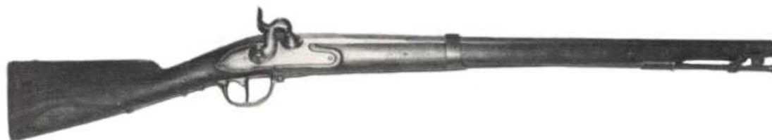
Specimen of the model of percussion “tercerola” which was tried by the Company of “Tiradores” of the Royal Guard’s Regiment of “Coraceros”, in 1831; Overall length 631 mm , 18 mm (“de a 17”) caliber barrel; Specimen number 2053 in the Catalogue of the Artillery Museum.

The Company of “Tiradores” of the Royal Guard’s Regiment of “Coraceros”, was the first one to try , in 1831, a piston model, one specimen of which, shown in the Catalogue of the Artillery Museum with number 2053, is at this time missing from the Collection of the Museo del Ejército; B. Barceló Rubí reproduces part of the report on this trial where it was compared to the weapons then in service: “the results showing (only) minimal difference in, number of