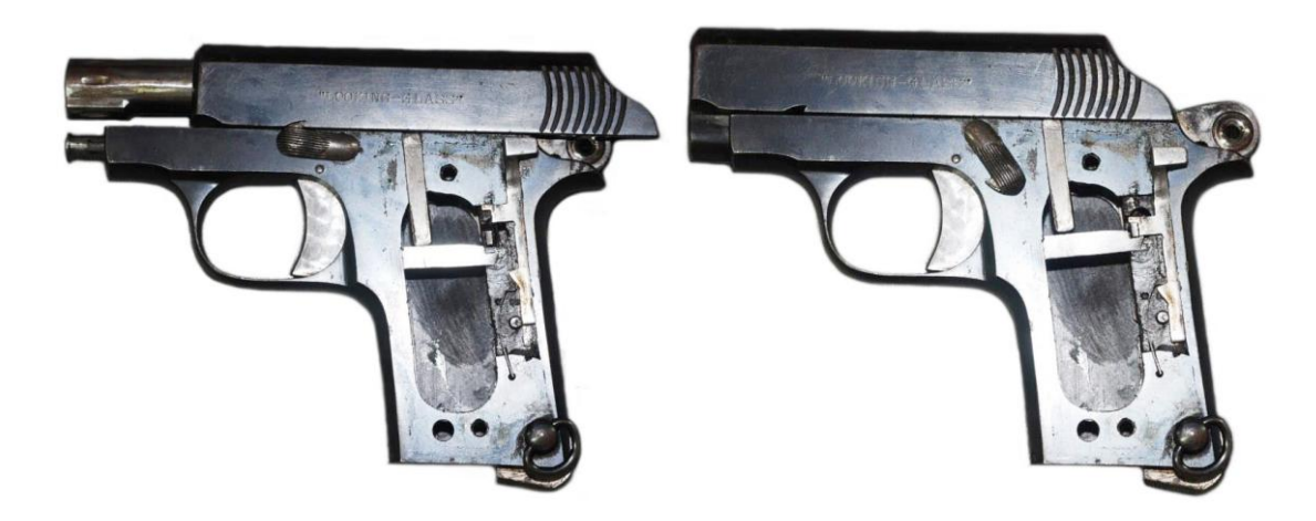
Left: The slide hold-open device, engaged; Right: The safety, below the hammer, in the downward "safe" position.

Left: Factory illustration clearly showing an "S" next to <u>both</u> "safety" levers; Right: Detail of the "S" on the rear and <u>only</u> actual safety and lack of it on the slide hold-open device above the trigger, as observed on the actual photographed specimen.