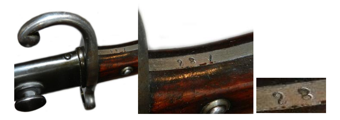
"Bayoneta de Filipinas ".....specimen numbered 28

Most readers are aware of the fact that shortly after the end of the Spanish-American War in 1898, the New York firm of Francis Bannerman acquired in public auction 90 % of the weapons, munitions, and equipment, captured by the US Army in Cuba, Puerto Rico and the Philippines which were then offered to the public by means of their illustrated catalogue ; It is from these catalogues, particularly the 1903, 1904, and 1910 editions, complemented by the references detailed in the Bibliography, and by data obtained from some friends and fellow collectors, that I have gathered the information that I will now offer.