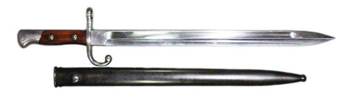
"Philippine" knife-bayonet, made by Weyersberg, Kirschbaum & Co.