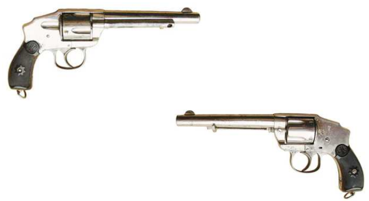
Five shot, 38 caliber, "Hammerless" revolver; Barrel length 134 mm, marked "COLT'S PT. F. A. MFG. C° / HARTFORD CT. U.S.A", serial number 53845; Logo "LGC" on grips (Larrañaga, Garate y Ca)

Eibar "Colt 1873", single action, six shot, 44 caliber, revolver; Barrel length 195 mm, marked "COLT'S CAL. 44 TERE THOSE THAT FIT BEST EUSKARO REVOLVER", serial number 33; Anonymous maker.