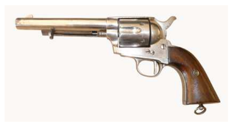
Single action, six shot, 44 caliber, Eibar "Colt 1873" revolver; Barrel length 183 mm, unmarked; Unknown maker.