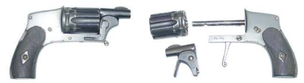
Six shot, 6 mm Velo-Dog caliber, "VELO-GAL" revolver; Barrel length 31 mm, marked: "VELO-GAL" and with Francisco Arizmendi logo.

Galan; He has a patent for a repeating pistol of the "BOLTUM" model and, also has a patent for another, very small, folding-grip revolver of extraordinary range"