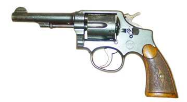
Six shot, 38 long caliber, "oscilante" revolver, 4 \frac{1}{2} " barrel, marked "IMPERIAL", proof "H" (1935).

If the naming of the Eibar "Smith", "Merwin", and "Colt's" revolvers was due to their similarity to the originals from, "Smith & Wesson", "Merwin, Hulbert, and Co" and "Colt's Manufacturing Co", the "oscilante" (oscillating) revolvers were named as a group due to their swing-out cylinder system with a star empty shell ejector, such as seen in the Colt Md.1889 Navy and the Smith & Wesson Military & Police.