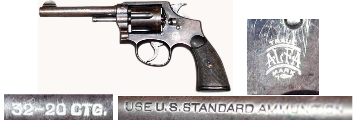
32-20 caliber, "oscilante" revolver, trademarked "ALFA", made by the "Sociedad Cooperativa Alfa"in Eibar.

Advertisements for "Unceta y Cia"'s "UNION" revolvers and for "Gabilondo y Ca"'s "RUBY EXTRA".