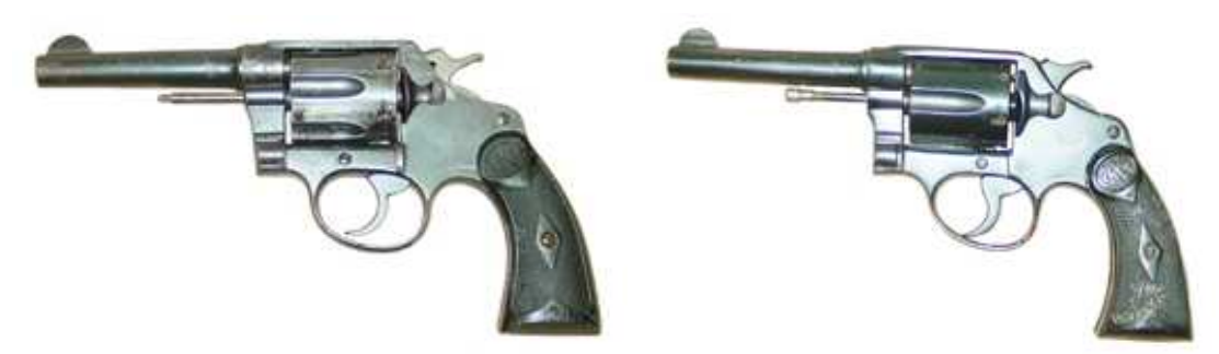
Two "Garate, Anitua y Ca", 38 Long caliber, "oscilantes" revolvers, the one on the left marked "DETECTIVE" and the one on the right "MUXI".