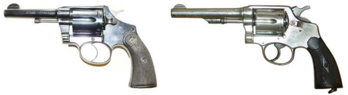
30 Long caliber "oscilantes" revolvers, the one on the left, from "Trocaola, Aranzabal y Ca" showing flagrant usurpation of Colt markings; The one on the right, from Antonio Errasti, marked "DREADNOUGHT".