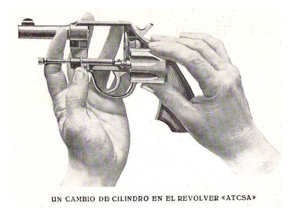
(Changing the cylinder of an "ATCSA" revolver)

"ATCSA" revolver, 38 caliber, six shot, 4" barrel, serial number 85, marked "ATCSA / PAT. 130396 / MADE IN SPAIN"