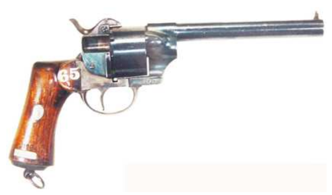
Md. 1863 Lefaucheux revolver, serial number 8,436, marked "OVIEDO 1874", modified with the Ibarra gas extraction system; Item number 5798 of the Army Museum Collection.

On April, 23, 1878, Ibarra patented his system in the "Republic of the United States of America", applying his system to a Smith & Wesson revolver of the same characteristics as the two sent to the Superior Artillery Board, and, on March, 18, 1880, a Royal Order authorized Chiefs and Officers of the Army "who by regulation used a rewolver, whether Smith or Lefaucheux, to adopt the Ibarra gas extraction system, but without this modification being compulsory"...an veritable pie in the sky.