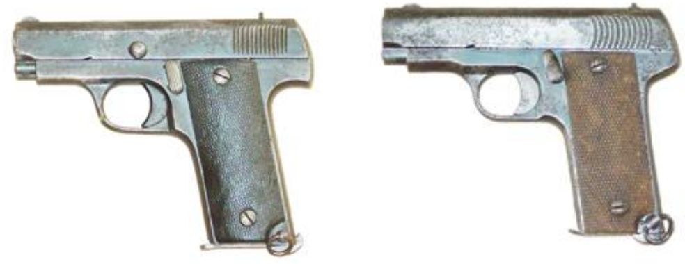
Nine shot, "Ruby-type" pistols: Left: marked PISTOLA AUTOMATICA CALIBRE 7,65 / GARATE ANITUA...EIBAR (ESPAÑA); Right: marked CAL 7,65 PISTOLET AUTOMATIQUE "DESTROYER" / I. GAZTAÑAGA-EIBAR.