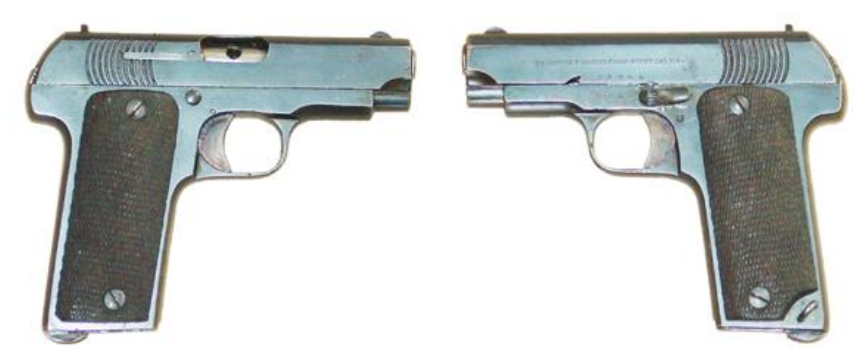
"RUBY" pistol, cal 7.65 mm, 9 shot, 88 mm barrel, marked: GABILONDOS Y URRESTI, EIBAR-RUBY CAL. 7,65

With the start of the Great War the closing of the markets and the freeze on international credits created a difficult situation for the Eibar arms makers; The Town Hall had to assist the unemployed by starting construction of the Eibar-Aguinaga highway, where many gunsmiths worked as laborers with pick and shovel, and by creating "popular kitchens" which provided food at nominal cost.