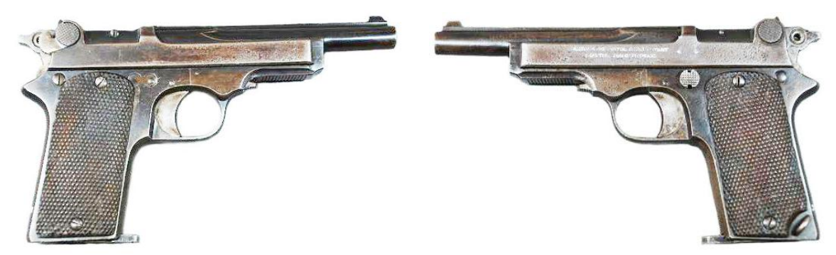
Model of 1914 STAR, eight shot, 7,65 mm caliber, pistol; 130mm barrel; Marked AUTOMATIC PISTOL STAR PATENT and STAR CAL 7,65

This, however, was not the case with the STAR Md. 1914, cal. 7,65 mm, pistols also acquired by the French Army, which were the product of patents owned by Bonifacio Echeverria, who also owned the STAR trademark of which 24,700 were acquired, a very small number compared to the more than 900.000 units provided, not only to France, but also to Romania, Greece and Italy.