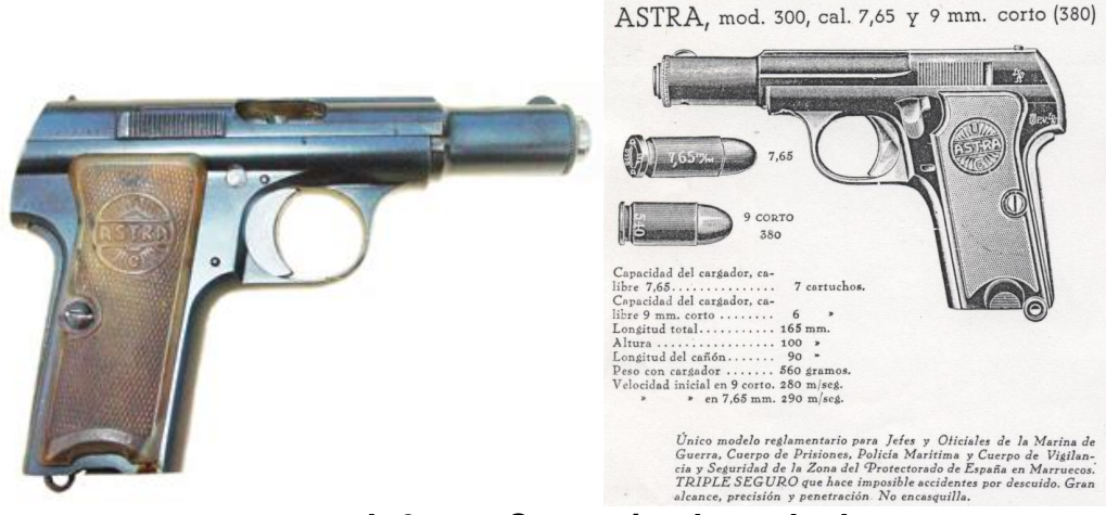
Left: ASTRA 300 SN 628383, cal. 9 mm Corto pistol, marked: UNCETA Y COMPAÑIA S.A. GUERNICA ESPAÑA, logo ASTRA U.C. Right: ASTRA 300 advertisement

After its adoption by the Army, the Model of 1921 pistol was adopted in 1922 by the Cuerpo de Carabineros (Border Guards) and the Prison Corps (Department of Corrections), in 1930 by the Vigilance and Security Corp of the Spanish Protectorate of Morocco, and in 1931 by the Military Aviation; The Navy adopted a variant of the Model 1921 which had a magazine release system similar to that of the ASTRA 300, which "Unceta y Ca" advertised as the "Only model approved for Chiefs and Officers of the Navy", something which I have not been able to document; I was told by an Artillery officer who had close relations to the firm that the R.O of adoption of the Model 1921 only stated "9 mm caliber" without specifying if 9 mm Largo or Corto, which allowed the Chiefs and Officers of the Navy and other Corps to use the ASTRA 300 as the "regulation" sidearm, as it was smaller and of more comfortable wear.