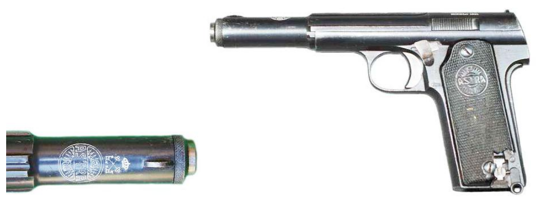
Navy Model of 1921, eight shot, 9 mm "Largo" caliber, pistol; SN 17, 671, marked: ESPERANZA Y UNCETA / GUERNICA / ESPAÑA / PISTOLA DE 9 mm / MODELO 1921, logo "ASTRA E.U." (Esperanza y Unceta 1921-26).

After its adoption by the Army, the Model of 1921 pistol was adopted in 1922 by the Cuerpo de Carabineros (Border Guards) and the Prison Corps (Department of Corrections), in 1930 by the Vigilance and Security Corp of the Spanish Protectorate of Morocco, and in 1931 by the Military Aviation; The Navy adopted a variant of the Model 1921 which had a magazine release system similar to that of the ASTRA 300, which "Unceta y Ca" advertised as the "Only model approved for Chiefs and Officers of the Navy", something which I have not been able to document; I was told by an Artillery officer who had close relations to the firm that the R.O of adoption of the Model 1921 only stated "9 mm caliber" without specifying if 9 mm Largo or Corto, which allowed the Chiefs and Officers of the Navy and other Corps to use the ASTRA 300 as the "regulation" sidearm, as it was smaller and of more comfortable wear.