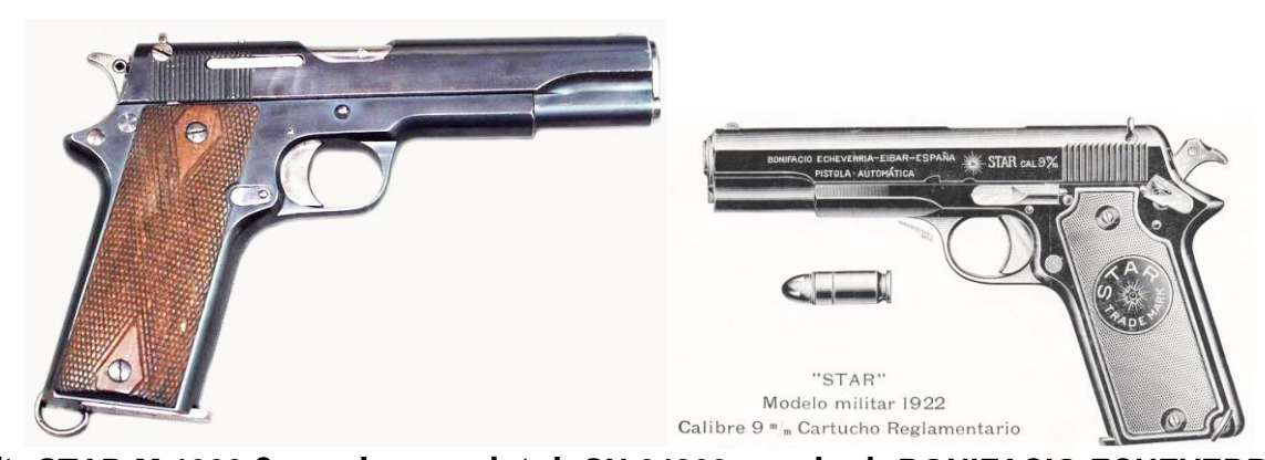
Left: STAR M 1922 9 mm Largo pistol, SN 24862, marked: BONIFACIO ECHEVERRIA – EIBAR (ESPAÑA) followed by the bursting STAR logo and "STAR" CAL 9 m/m 38; preceded by the Guardia Civil emblem on the frame and on the matching number magazine; Right: STAR M1922 advertisement. Notice that only the thumb safety remains, the grip safety having been eliminated.

We must point out that in the above adoption there was no official model designation for the weapon, as there were two models in service simultaneously, the Models of 1920 and 1921, both publicized by Bonifacio Echeverria as "Adopted by our Government for the Guardia Civil"; A third model then followed after the Model of 1921, differing from it by the lack of the grip safety, named by Bonifacio Echeverria the, "STAR 1922 Military Model" and proclaimed as being "Declared as regulation for the Institute of the Guardia Civil, by R.O of October , 5, 1922 (D.O n° 226)(and) of great usefulness for all armed corps"