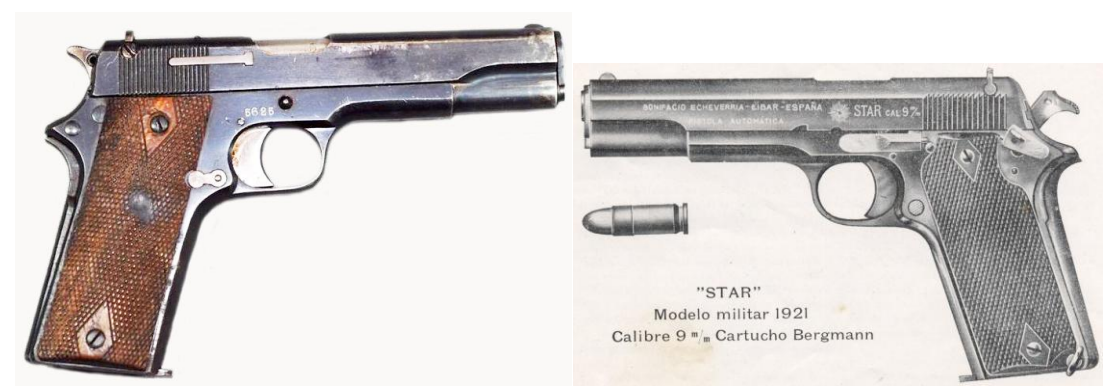
Left: STAR M 1921 9 mm Largo pistol, SN 5625, marked: BONIFACIO ECHEVERRIA – EIBAR ESPAÑA followed by the bursting STAR logo and "STAR" CAL 9 m/m 38; and preceded by the Guardia Civil emblem on the left frame and on the matching number magazine; Right: STAR M1921 advertisement. Notice the thumb and grip safeties similar to the M1911 Colt.

Because of the second point mentioned in the official adoption of the "Model 1921 9 mm Pistol", for the Army and Navy, it was necessary to add: "the adoption as regulation (sidearm) for the exclusive use of officers and enlisted men of the Guardia Civil, of the 9mm Largo caliber "Star" pistol, with the understanding that all matters regarding its issuing, refurbishing and spare parts, are the sole responsibility of this Corp", by R.O of October, 5, 1922.