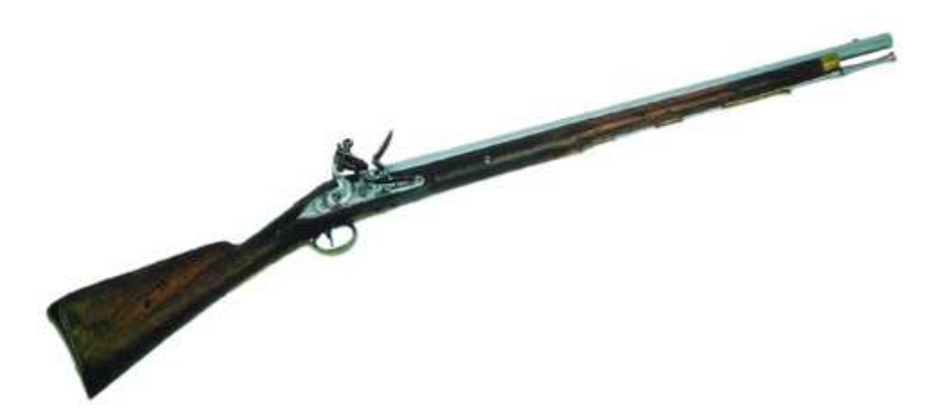
Elliott carbine for Dragoons; 713 mm long, 16 mm. ("de a 23") caliber barrel, specimen number 2251 of the Collection of the Museo del Ejército.

A detail typical of this "2<sup>nd</sup> model" is the system of retaining the ramrod, with a widening at its entrance and a slit into which the retaining piece is inserted in order to prevent its accidental release. This type of ramrod was taken from the Elliott carbines used by the British Dragoons during the War of Independence.