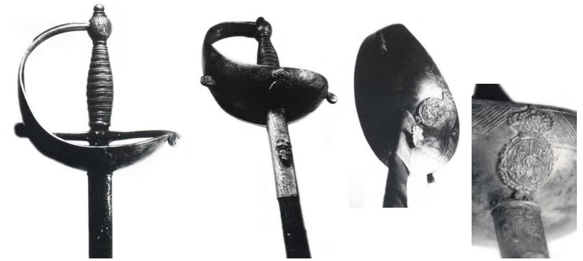
"Commercial" sword used by a Major Officer of the Royal Corp of Halberdier Guards, circa 1880; Polished brass grip, bearing the Arms of the Royal Household on its guard.

The Major Officers had to acquire "commercial" swords, made by military gear manufacturers, who made them in models adequate for use by this Royal Corp, using blades made at the Toledo Factory